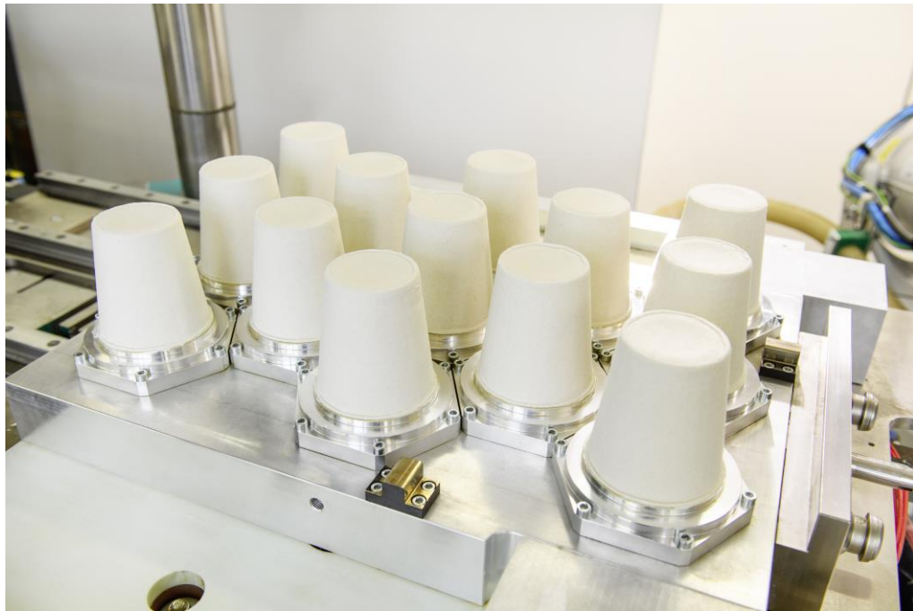
Pre formed products at hot press station