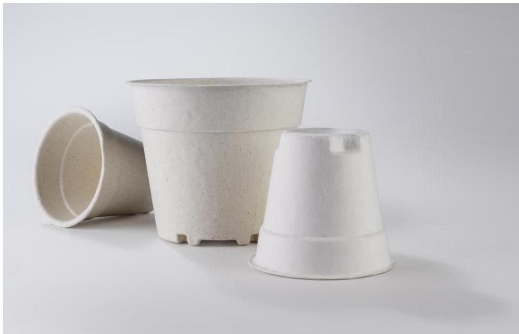
Product diversity of fiber formed products